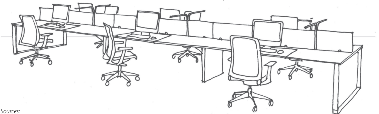
Mobile and Team Application