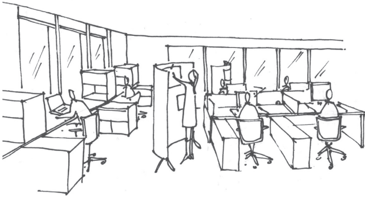
Studio and Team Application

Benching is more than just a piece of office furniture; it's a method of working. It is most appropriate when designing environments that need to be creative, flexible, adaptable, and energized (Wassenaar, 2011). While benching can be applied in many situations, it is best suited to dynamic, interactive, social work styles and not as effective for a task or a workplace that requires quiet, privacy, confidentiality, or work involving deep concentration.