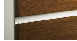
Wood J - Pull