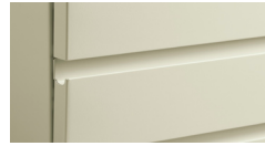
Steel J - Pull